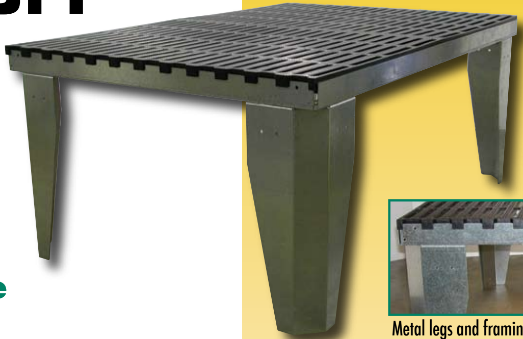
Metal legs and framing!

VAL-CO's Better Bench System has been designed for strength, durability and value. The Better Bench can be permanently installed or can be used as a freestanding bench. With an easy bolt together design, the Better Bench can be assembled in