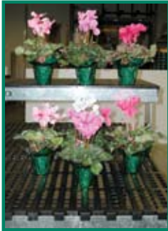
The Better Bench tiered option provides more space and attractive displays!

Should you have any questions, please feel free to contact us.