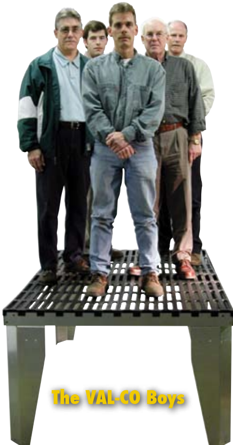
The VAL-CO Boys

less time than conventional bench systems. Designed for maximum loading, the Better Bench can support over 40 lbs per sq.ft. With removable tops, cleaning is easy and quick as is relocation of the bench to another area, a great feature for Garden Centers where portability is a must. With it's unique angled legs, watering hoses glide around the corners preventing kinks and cuts. The black bench top prevents light reflection back to the plant and the ventilation slots allow for maximum air circulation and water drainage around the plants.