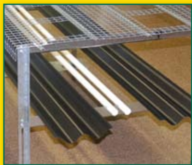
VAL-CO's Growing Stands have integrated holders for heating pipes or irrigation lines.