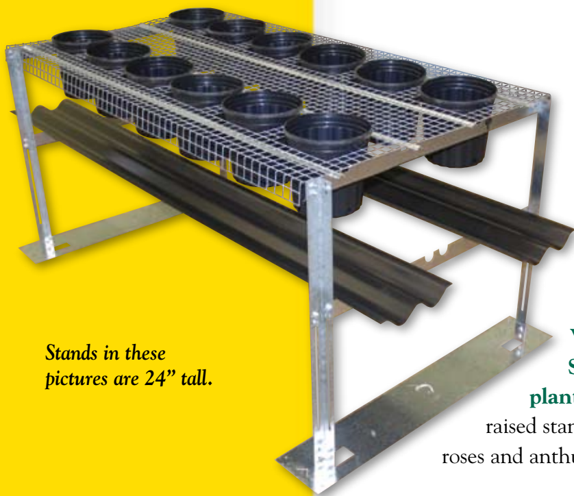
Stands in these pictures are 24" tall.